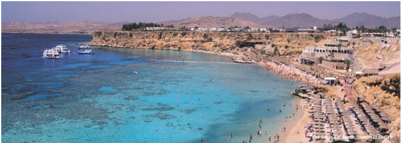
Ras Umun Sid Beach, Sharm El Sheikh